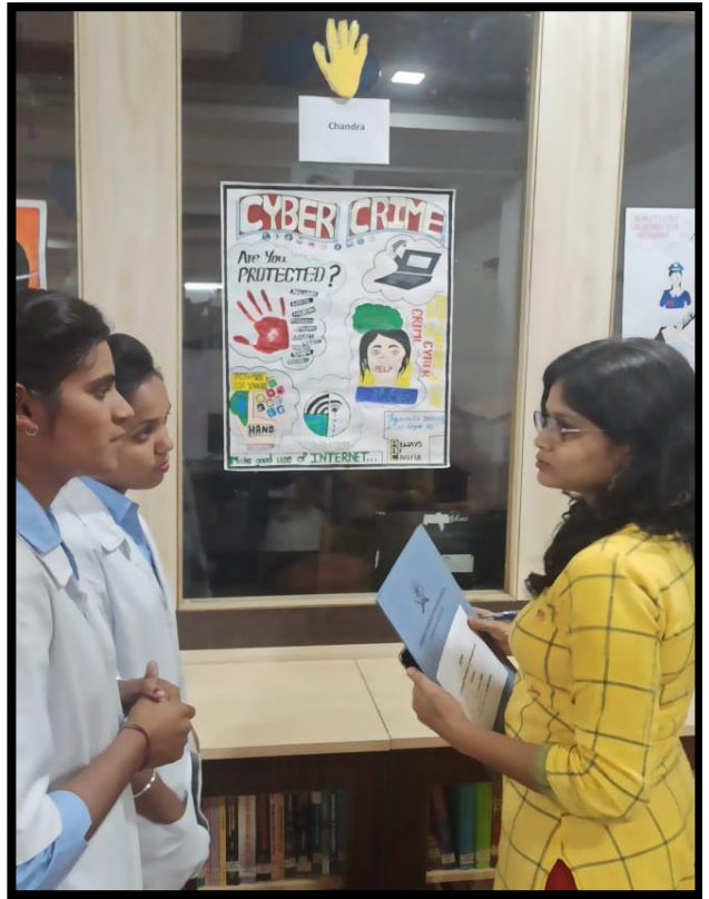
Poster Presentation by participates