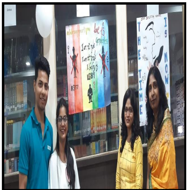
Participants preparing the posters