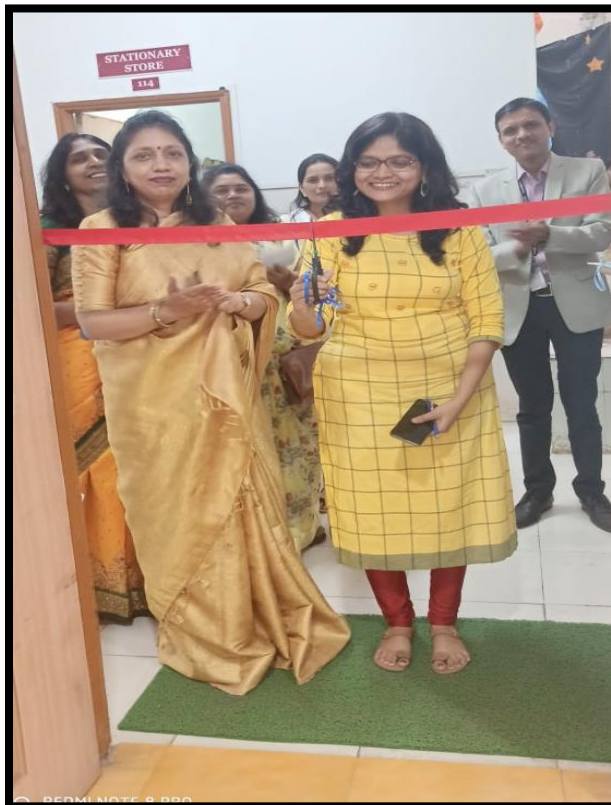
Inauguration of Event