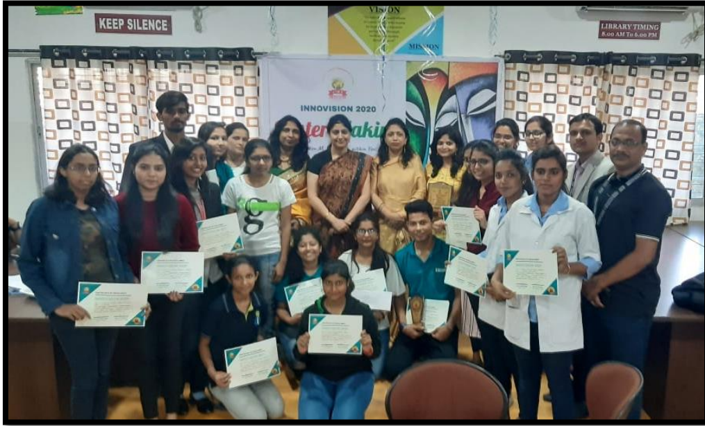
All the participants, Winner, Runner Up and Chief guest and Faculty Members