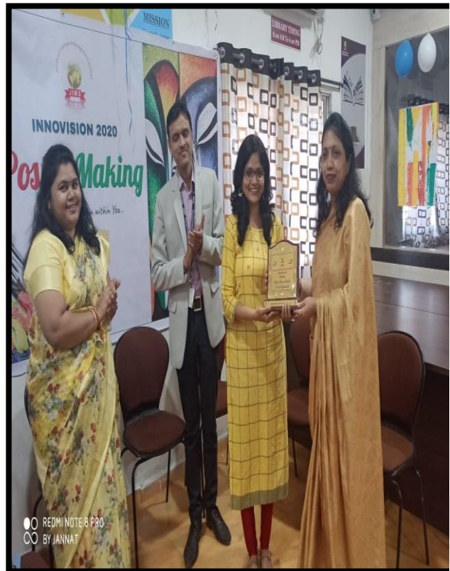
Chief Guest Felicitation